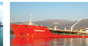
SUEZMAX AND VLCC