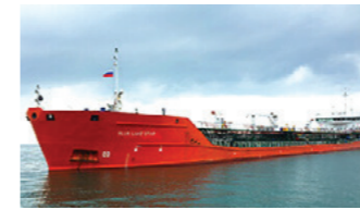
BLUE LAKE STAR

IMO: 9427990 BUILT YEAR: 2009 DWT: 14374