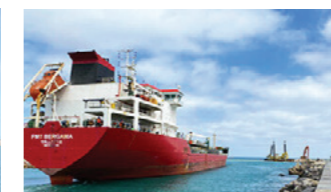
MEDIUM / HANDY TANKERS